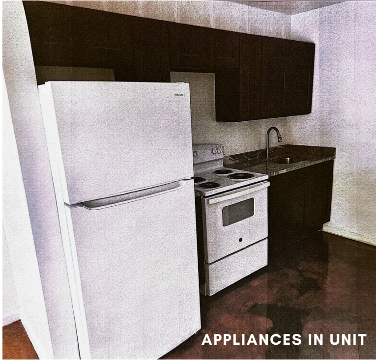
APPLIANCES IN UNIT