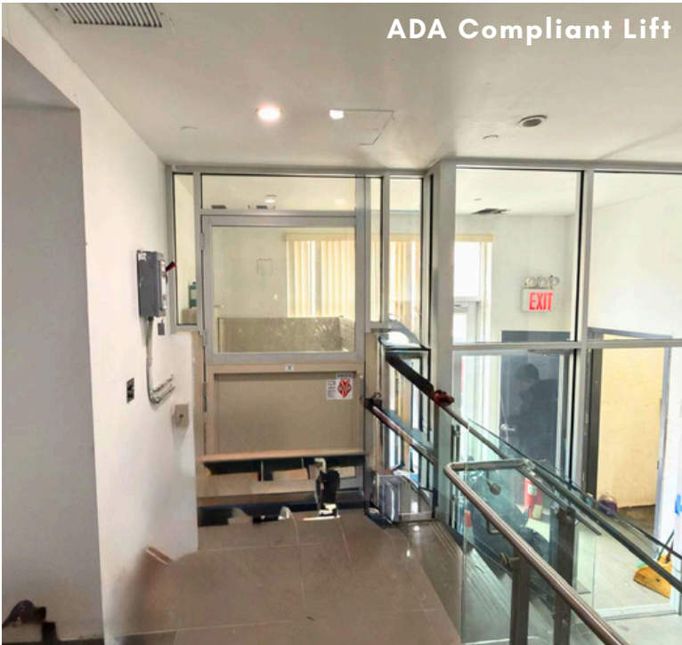
ADA Compliant Lift